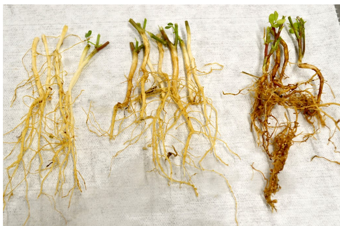
Figure 5. Progressing severity of Aphanomyces root rot in lentils.

exists. It can be difficult to see the honey-brown root discolouration of Aphanomyces when Fusarium is also present. At advanced Aphanomyces root rot infection stages, only the vascular bundles remain, as the entire root system has decayed and plants are chlorotic, wilted, and will prematurely die. Aphanomyces symptoms appear within 7-14 days after the first root infection, depending on soil moisture and temperature, and susceptible host plants can become infected at any growth stage. Even though root infections are favoured by wet conditions, the symptoms and yield impact are most severe under warm, dry conditions after infection takes place.