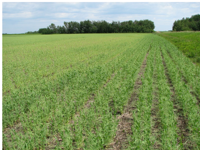
Figure 6. Pea field with root rot infected plants (left) and healthy plants (right). Often healthier plants are found on field margins where vegetation from ditches or tree lines helps remove excess water, or fields slope downward to provide rainfall runoff.

Severe root rot caused by Aphanomyces impairs the uptake of water and nutrients by infected plants. Yield loss from Aphanomyces root rot can be difficult to assess because of the numerous indirect effects it has on the crop, as well as the timing of the initial infection. Early