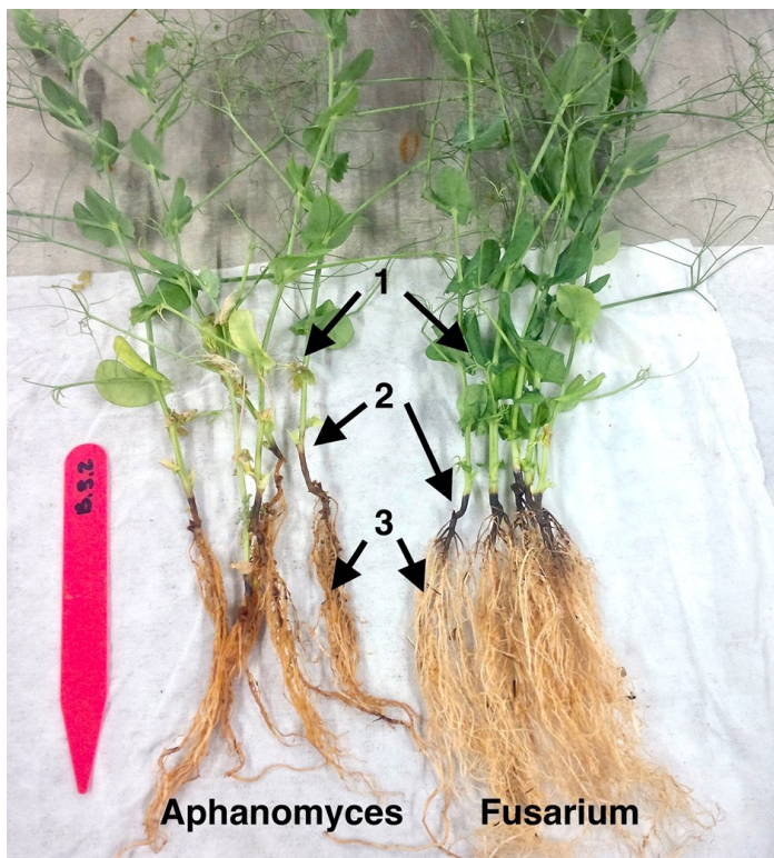
Figure 8. Aphanomyces infection is characterized by (1) yellowing and wilting of shoots, (2) pinching of epicotyl, stopping abruptly at soil line, (3) lateral roots with watery and honey-brown decay. Fusarium infection sees (1) shoots remaining healthy, (2) blackened tap root, starting at seed attachment, (3) healthy lateral roots.

season infections cause plants to die prematurely, causing a direct and substantial yield loss. Later season infections can delay crop maturity, thereby affecting harvest timing, and also weaken the plant stems, causing severe lodging and harvest challenges. Research has reported reductions in both pod size and seed number, as well as decreased seed quality due to Aphanomyces root rot. A thin crop stand can also cause challenges in weed management as weed competition can negatively impact yield, affect harvestability, cause increased dockage at the elevator, and contribute to the weed seed bank in the soil.