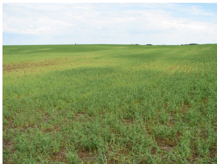
Figure 9. Patches of root rot, especially in the low spots where water sits, can develop in severely infected fields.

Because soil is variable across a field, the presence of Aphanomyces can also vary across a field. Patches of Aphanomyces root rot can develop in low spots that remain more saturated, or in compacted areas such as at field entrances. In some cases, patches are not always obvious. In years of excessive rainfall, it is possible to find nearly entire fields infected from Aphanomyces and other root rot pathogens. Within the soil profile, research found that the top 20 cm (eight inches) of soil contained the highest Aphanomyces inoculum levels, although there was still enough inoculum to cause infection as deep as 40-60 cm (16-24 inches).