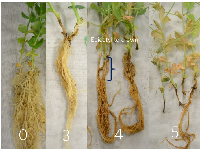
Figure 10. Examples of the Aphanomyces root rot rating scale. 0 = No symptoms 3 = Start to see discoloration of crown/epicotyl. 50 to 75 per cent of the roots have browning 4 = Honey-brown epicotyl/crown area. 100 per cent of the roots are brown and first leaves are dying off 5 = Plant is dead. Decay and loss of all roots and usually only vascular string remains. Honey-brown epicotyl/crown area

To measure root rot severity, researchers use a 0-5 Aphanomyces root rot rating scale, in combination with a 1-7 Fusarium root rot scale when both pathogens are present. Since most infections in the field are typically combined infections, the Fusarium 1-7 scale is often used, as it is very difficult to see the honey-brown discoloration from Aphanomyces when Fusarium is also present.