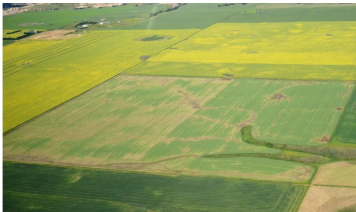
Figure 12. A pea field infected with Aphanomyces root rot near Drumheller, AB. The importance of crop rotation is shown by the clear division down the centre of the field. Prior to being farmed as one field, the more diseased half on the left had been in pea production longer than the healthier half on the right.

If a history of root rot exists, then individual fields should be tested for Aphanomyces euteiches . Fields confirmed to have A. euteiches present should not have peas or lentils planted on them for a minimum of six years, but preferably eight years. The best pulse crop options for these fields are faba beans, soybeans, or chickpeas, although chickpeas may develop low levels of infection. The challenge with Aphanomyces is that the oospores can survive in their resting state for 10-15 years, even when no host is present. Though inoculum levels will be reduced after a few years away from peas or lentils, fields with even moderate inoculum levels will require several years of non-host crops to reduce the inoculum to a level that will not impact yield. Since the effectiveness of crop rotation directly depends on the length of rotation, the longer the lapse between susceptible host crops, the more inoculum reduction that will occur in the soil, although complete eradication of Aphanomyces root rot through long-term rotations may not be achievable.