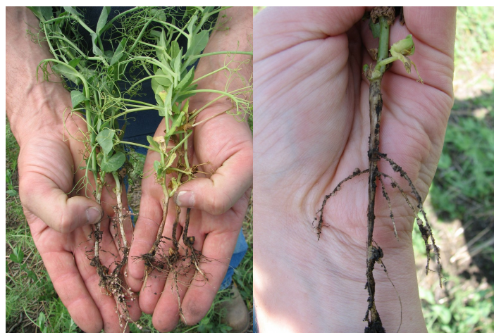
Figure 7. Healthy (left) and root rot infected peas (right) from the infected field. Light brown discolouration and pinching of the epicotyls indicate the presences of Aphanomyces . Blackening of the tap root (right), in addition to the light brown and pinched epicotyl, indicates that Fusarium colonized this pea root likely after Aphanomyces caused the initial infection (photos taken from field in Figure 6, near Rosthern, SK).