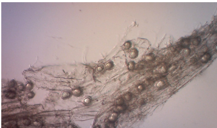
Figure 1. Oospores, shown here in host plant root tissue, are round with thick walls that allow them to survive for many years, even in harsh environments.

Aphanomyces euteiches is classified as an oomycete, or water mould, and is not a true fungus. The resting spores, called oospores, are thick-walled and allow the pathogen to survive in the soil during harsh winter conditions.