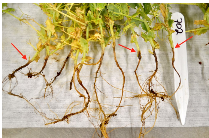
Figure 4. Aphanomyces infection progresses into the main root and then the epicotyl (portion of stem above the cotyledons, which stay below-ground in peas and lentils). The epicotyl becomes pinched and infection stops at soil level (indicated by red arrows).