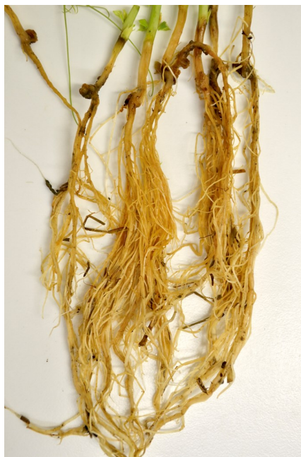
Figure 3. Honey-brown discolouration of pea roots, characteristic of Aphanomyces euteiches .